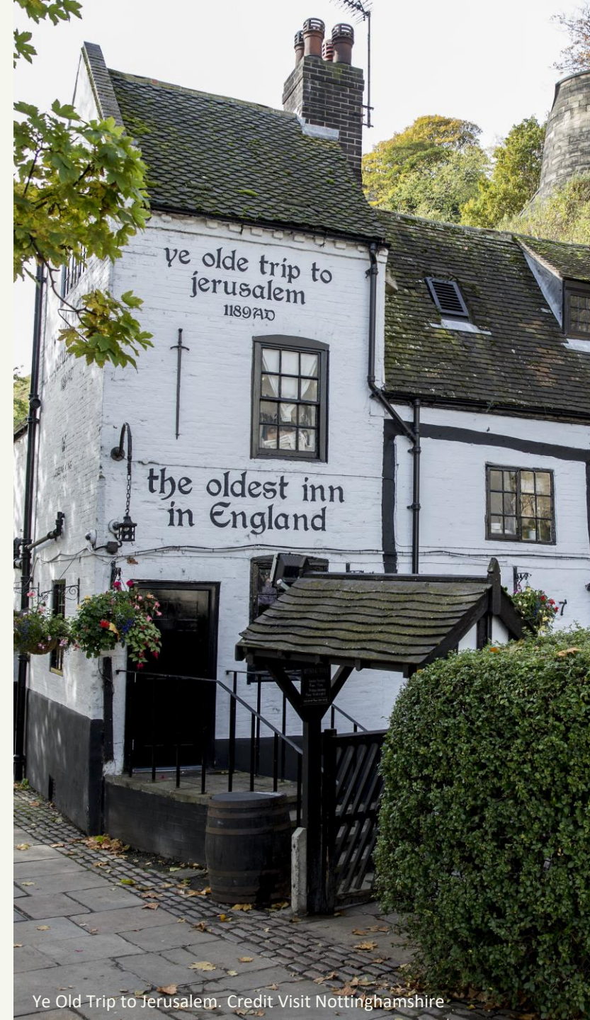
Ye Old Trip to Jerusalem.