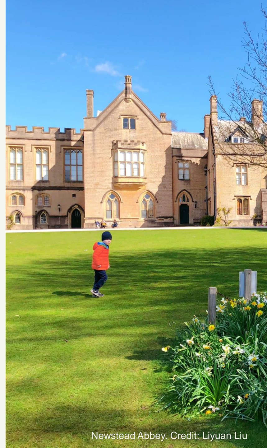
Newstead Abbey.

MEET IN NOTTINGHAM is focusing on bringing business visitors to Nottingham and Nottinghamshire. Meet in Nottingham offers a raft of event services for both event organisers and delegates.