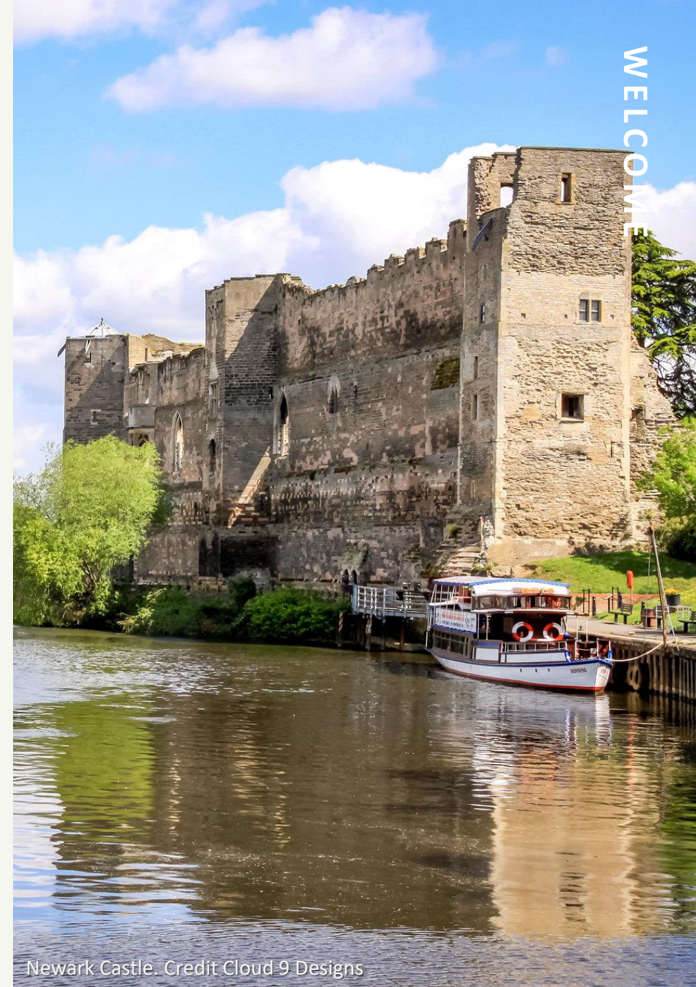
Newark Castle.