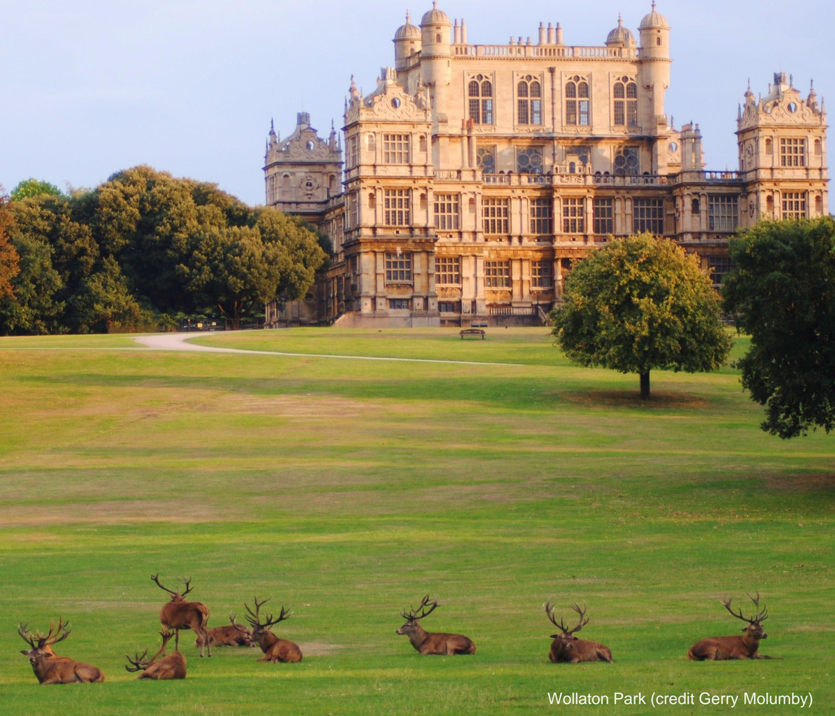
Wollaton Park