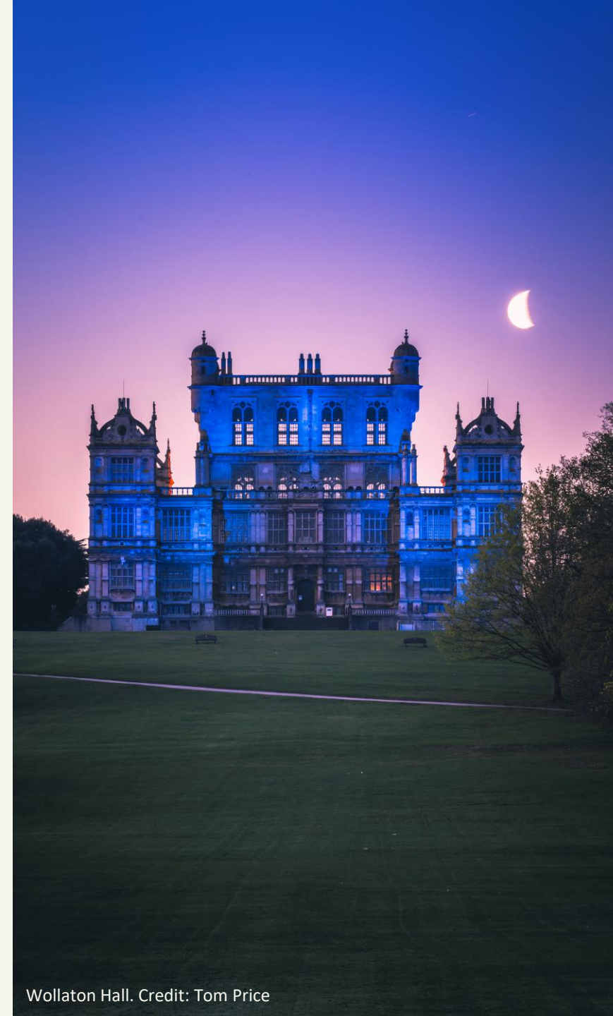
Wollaton Hall.